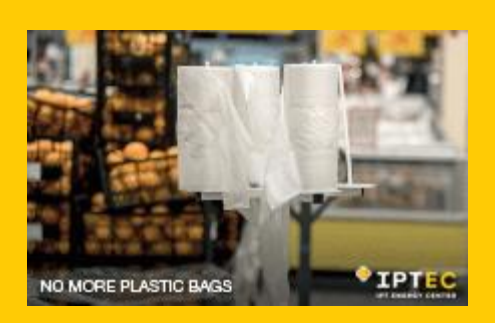
Jbeil Municipality Bans The Use of Plastic Bags

Starting in 2019, the Jbeil municipality will ban all use of plastic bags - a bold initiative to address the country's addiction to plastic that has garnered the praise of many environmental groups in Lebanon. "The Jbeil municipality got it right," Julien Jreissati, Arab world campaigner at Greenpeace Mediterranean, told The Daily Star. "Our path out of this garbage crisis starts by reducing the amount of waste we produce. Given the catastrophic waste management situation, most of the waste we throw comes right back at us, either on our shores, in our lungs or on our plates". * Source: Daily Star